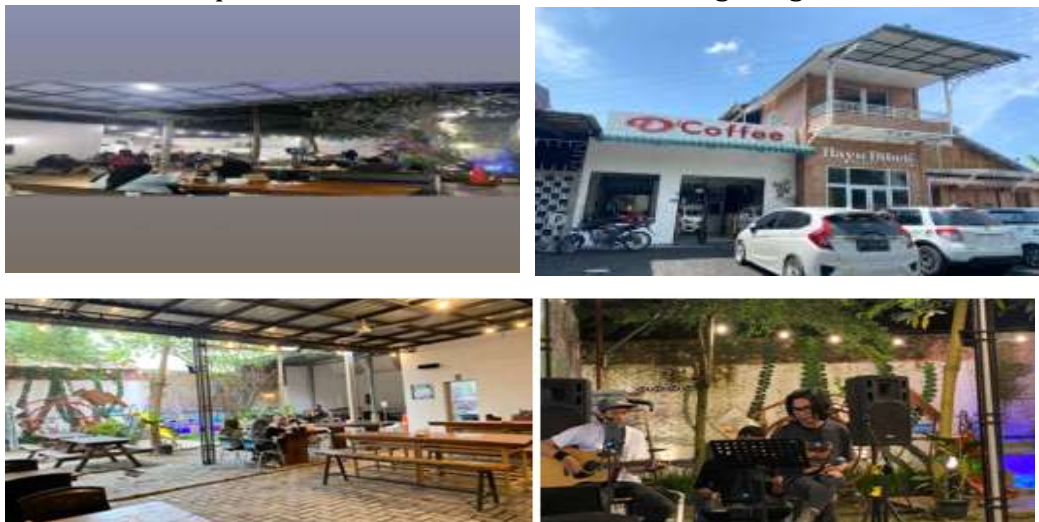
Figure 1. Profile of Ducan Coffee

D'Coffee or Ducan Coffee was formed in 2017. This business was inspired by the increasing need for a place to relax in urban areas. D'Coffee is a modern coffee shop business that provides processed food and drinks accompanied by a relaxing room. The term Ducan Coffee specifically means "Duduk Cantik Coffee" which is expected to be a special attraction for consumers and become a trend term for the products offered. Another reason from the owner, why open this business is because the owner has a high business spirit, namely during school he had opened a burger business with a selling model using an angkringan cart. And previously he had also worked with several friends even though it ultimately failed so he decided to open his own business. In addition, D'Coffee can also be a source of livelihood. D'Coffee's business has proven to be able to help many people by hiring several employees who are struggling with economic problems. And the greater the market share, the higher the economic value and benefits for the community. The D'Coffee business profile can be seen from the following image: