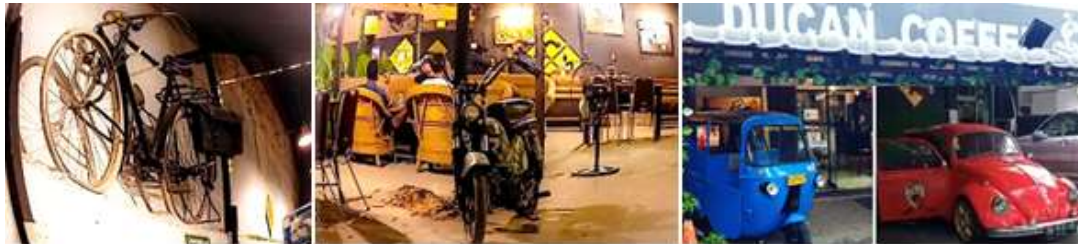
Figure 2. Classic vehicles and scenery at Ducan Coffee

In an effort to increase its competitiveness, D'Coffee has succeeded in presenting innovative products such as Hot Sanger, Machiato and Ginger Tea which are the favorite menus at D'Coffee. Is D'Coffee management also creatively offers a classic nuanced contemporary cafe atmosphere, namely by displaying classic vehicles, ancient pictures which are expected to be the main attraction for consumers to enjoy. The implementation of the concept of creativity in the D'Coffee modern coffee shop business, among others, can be seen from the following pictures: