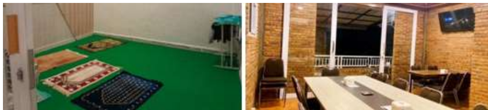
Figure 6. Musholla and Meeting Room