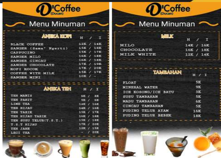
Figure 3. Beverage Menu Offered by Ducan Coffee.