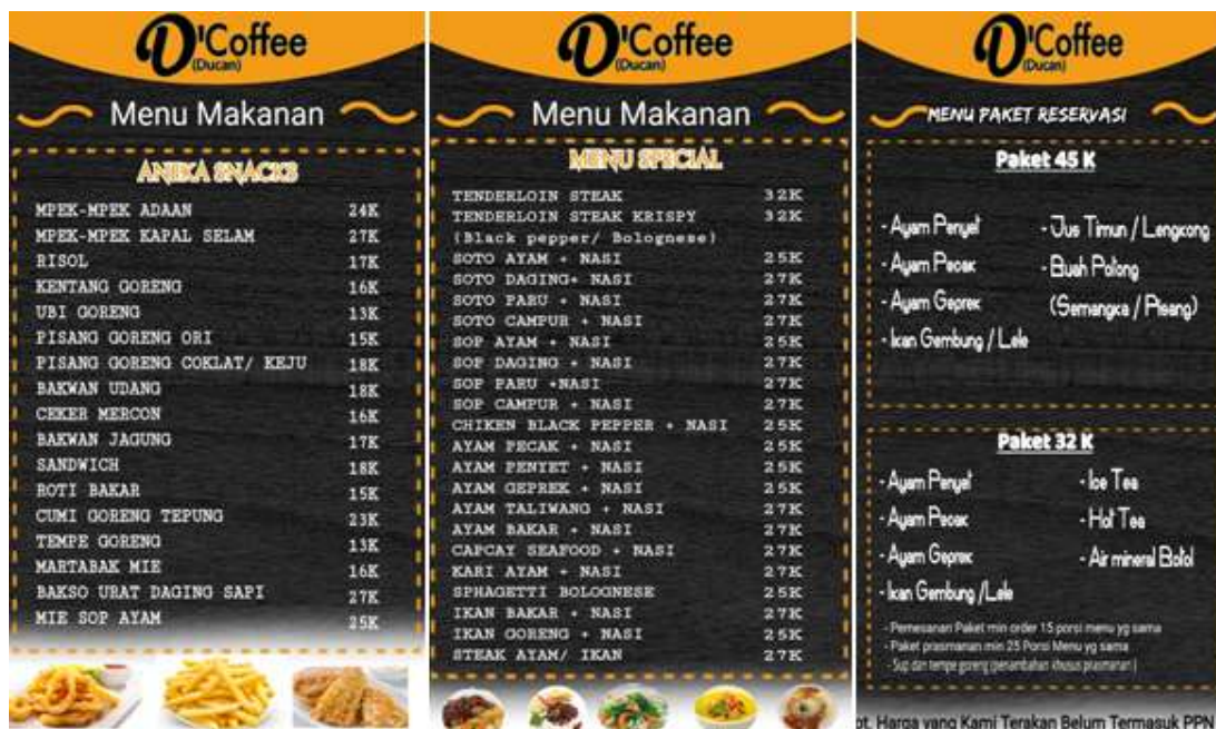
Figure 4. Food Menu Offered by Ducan Coffee.

Based on these several pictures, the author then analyzes how consumers respond to the implementation of the concept of creativity in the D'Coffee business. The results of interviews with respondents about "the ability to generate many ideas". Of the 20 respondents asked, 15 people answered "Yes" with the explanation that the D'Coffee business has many business ideas that are current so that the food and beverage menu including the café atmosphere is not boring.