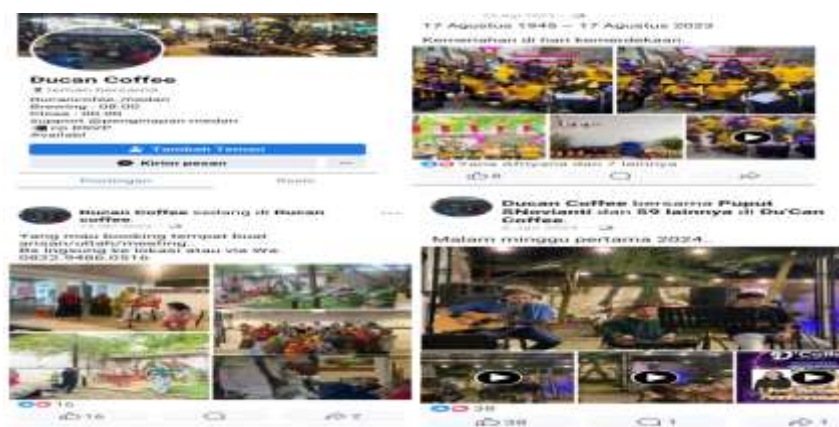
Figure 8. Promotion of D'Coffee via Facebook and Tiktok.