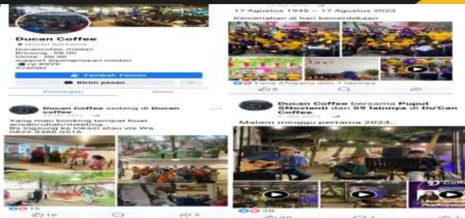
Figure 7. D'Coffee promotion through Facebook