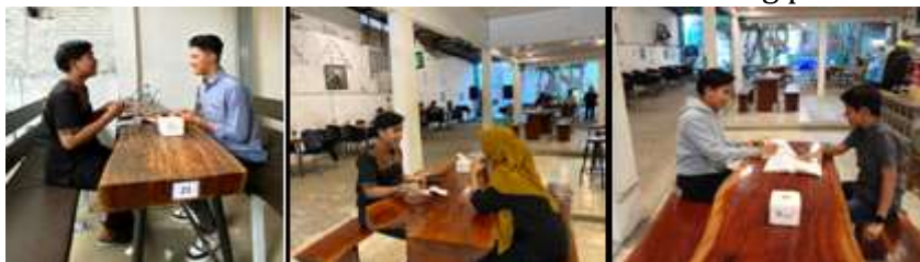
Figure 10. Data Collection Documentation.

From the results of interviews and discussions that have been carried out, to be able to achieve higher business performance, D'Caffe management must also pay attention to the knowledge and skills of its employees in order to increase the competitiveness of its business. With the ability of reliable employees, the development of creativity and innovation will be even better at every stage of D'Caffe's work process. The documentation of the implementation of this research can be seen from the following picture: