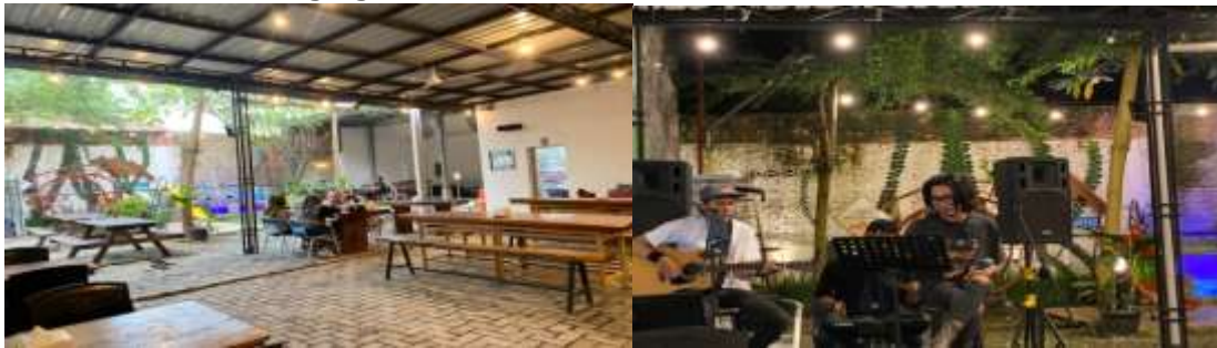
Figure 5. Live Music and Children's Playground.

Other information obtained, most consumers agree that D'Coffee is a comfortable place for parents, teenagers, and children because it has many facilities such as free Wi-Fi, live music , children's playground, meeting rooms , prayer rooms and other facilities. And currently D'Coffee has promoted its business through social media such as Facebook, TikTok, Instagram and built business partnerships with GoFood. As for some of the efforts that D'Coffee has made to support the effectiveness of D'Coffee's marketing strategy, it can be seen from the following figure: